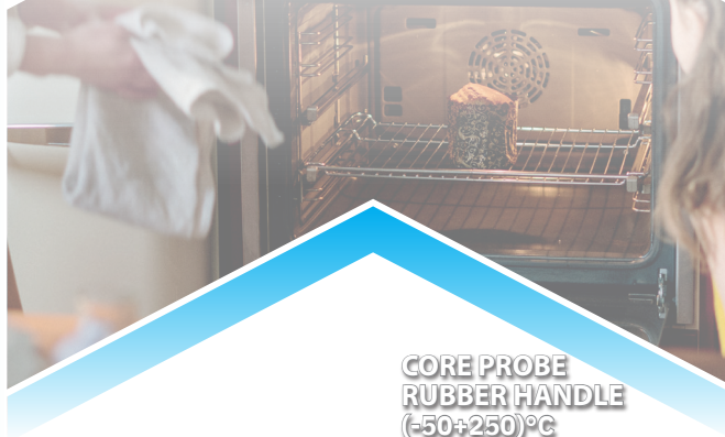
CORE PROBE RUBBER HANDLE (-50+250)°C