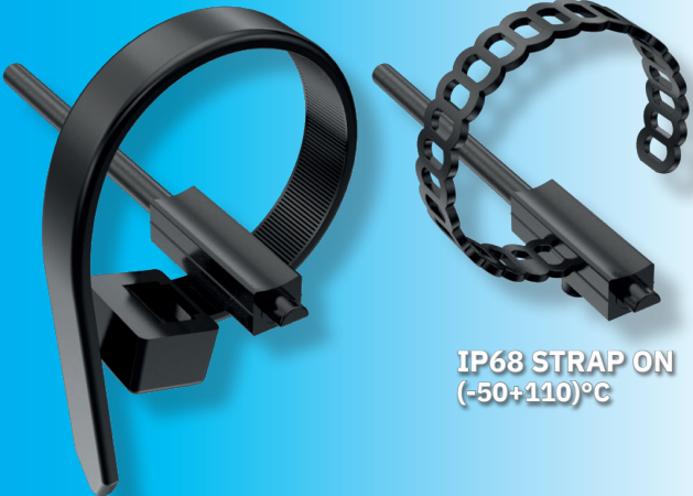
IP68 STRAP ON (-50+110)°C