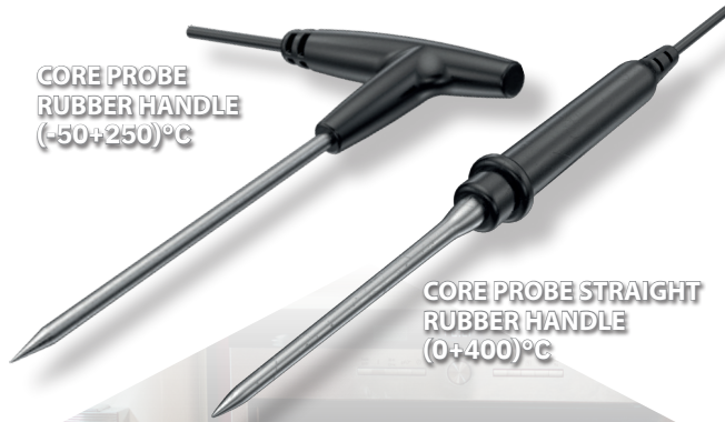
CORE PROBE STRAIGHT RUBBER HANDLE (0+400)°C