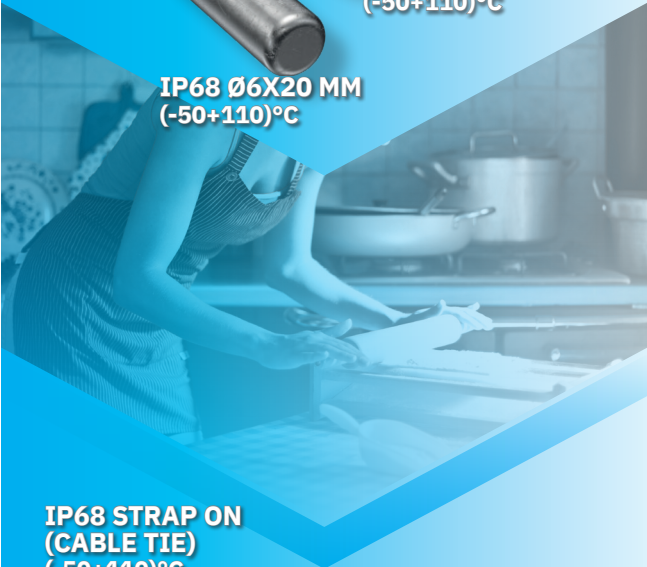
IP68 STRAP ON (CABLE TIE) (-50+110)°C