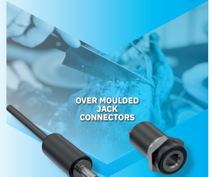
OVER MOULDED JACK CONNECTORS