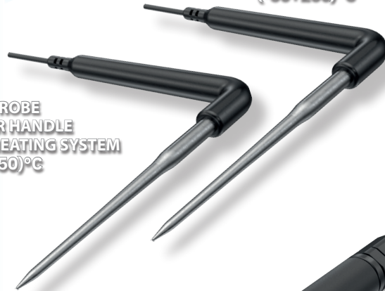
CORE PROBE RUBBER HANDLE WITH HEATING SYSTEM (-50+250)°C