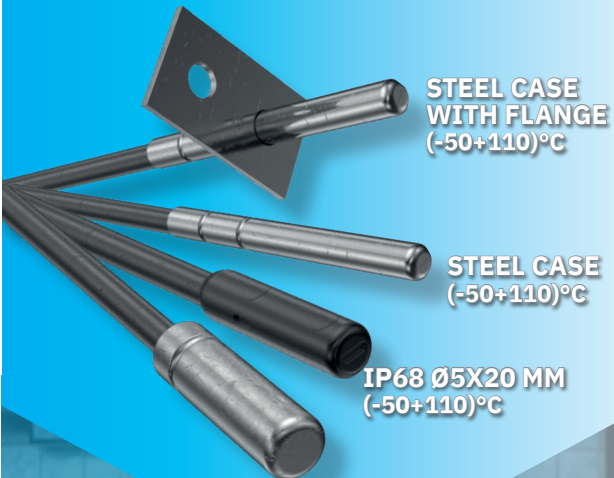
STEEL CASE WITH FLANGE (-50+110)°C